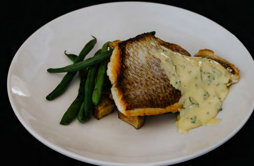
Seared Red Snapper

Chefs Jorge Campoverde & Matthew Venzke can design dazzling seasonal, locally sourced custom menus to perfectly fit your event. Custom wine pairings are also available. Please inquire with the Events Office to schedule a meeting to discuss your needs