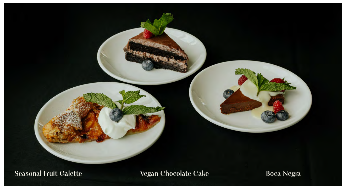
Seasonal Fruit Galette

Made with local milk, cream, and fruit. Ask for availability of flavors Can be made GF, DF, or V upon request 5 day notice required