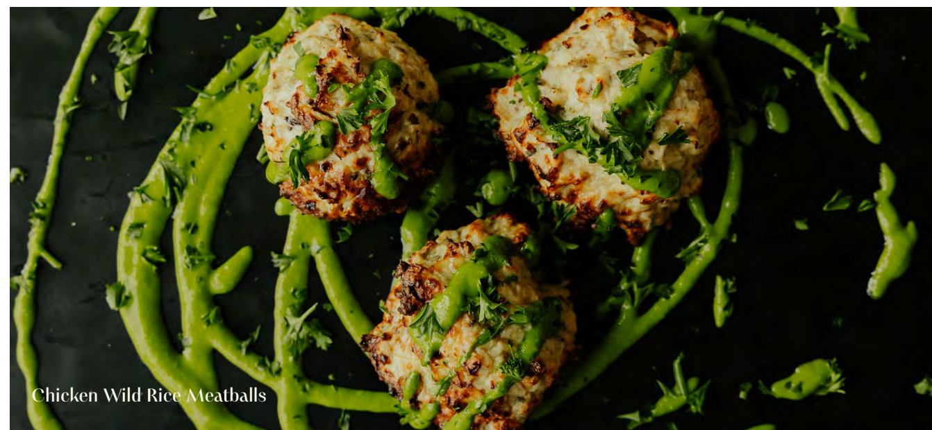
Chicken Wild Rice Meatballs

Mini house made potato and zucchini savory pancakes with apple chutney & sour cream