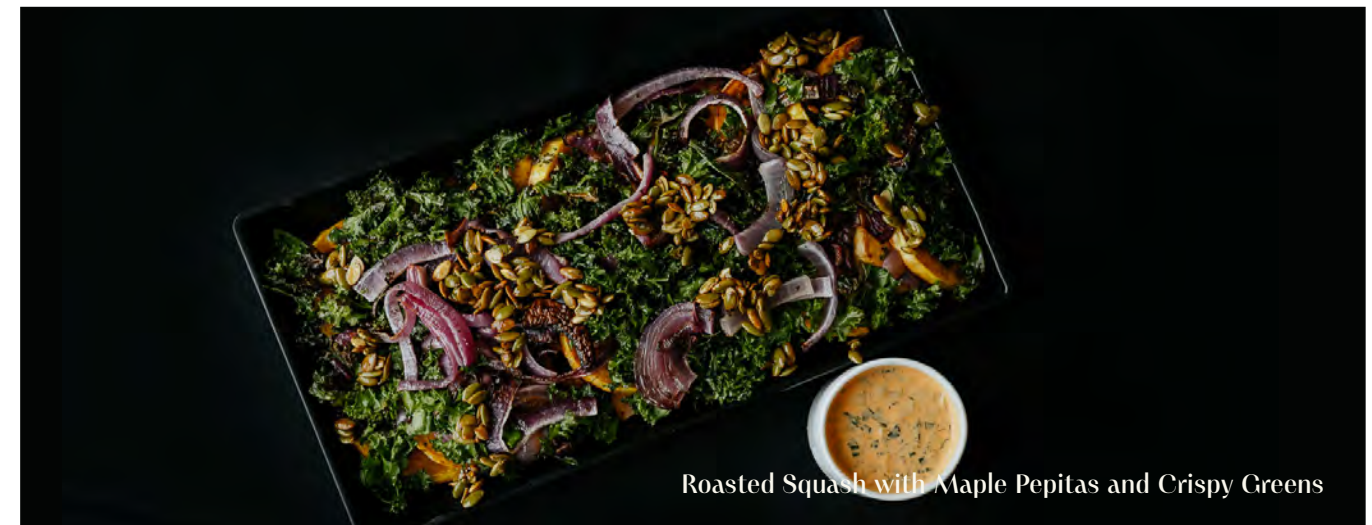
Roasted Squash with Maple Pepitas and Crispy Greens

Large (Serves 45-50) Medium (Serves 30-35) Small (Serves 15-20)