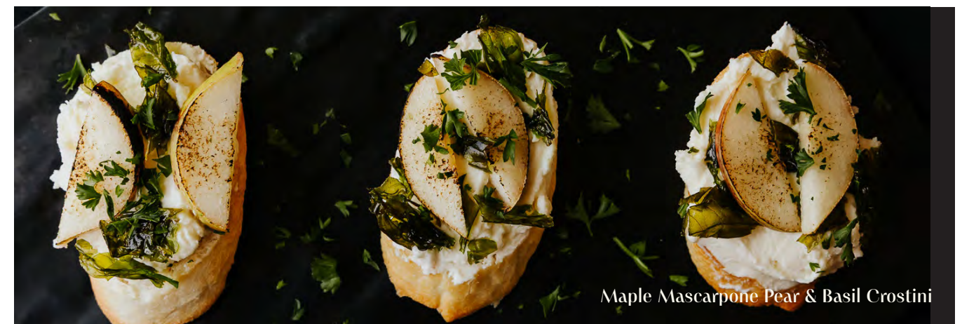
Maple Mascarpone Pear & Basil Crostini

Truffle Parmesan Smoked Paprika Garam Masala