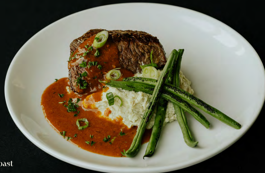
Rosemary Pot Roast

Pan-seared and served with Hope Creamery butter and herbed potatoes